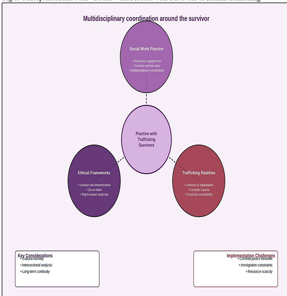
Fig 1: Conceptual Framework - Social Work Practice with Survivors of Human Trafficking

Survivor-centred and rights-based frameworks have emerged as a corrective, emphasising survivor leadership in service design, sustained material support across the long arc of recovery, attention to the structural conditions of vulnerability, and the right to self-determination including the right to decline cooperation with prosecution (Macy and Graham 2012; Cole 2018). These frameworks are aligned with established social work values, yet their full operationalisation requires institutional change well beyond the scope of any individual practitioner.